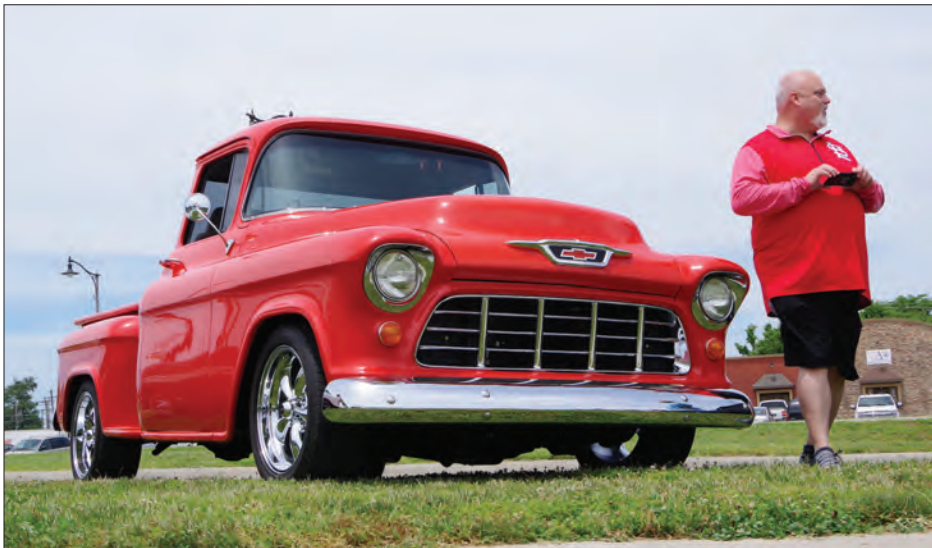
This 1955 Chevy truck owned by Leland Townsend was one of the eye-catching classics that was on display at the last Route 66 Festival.